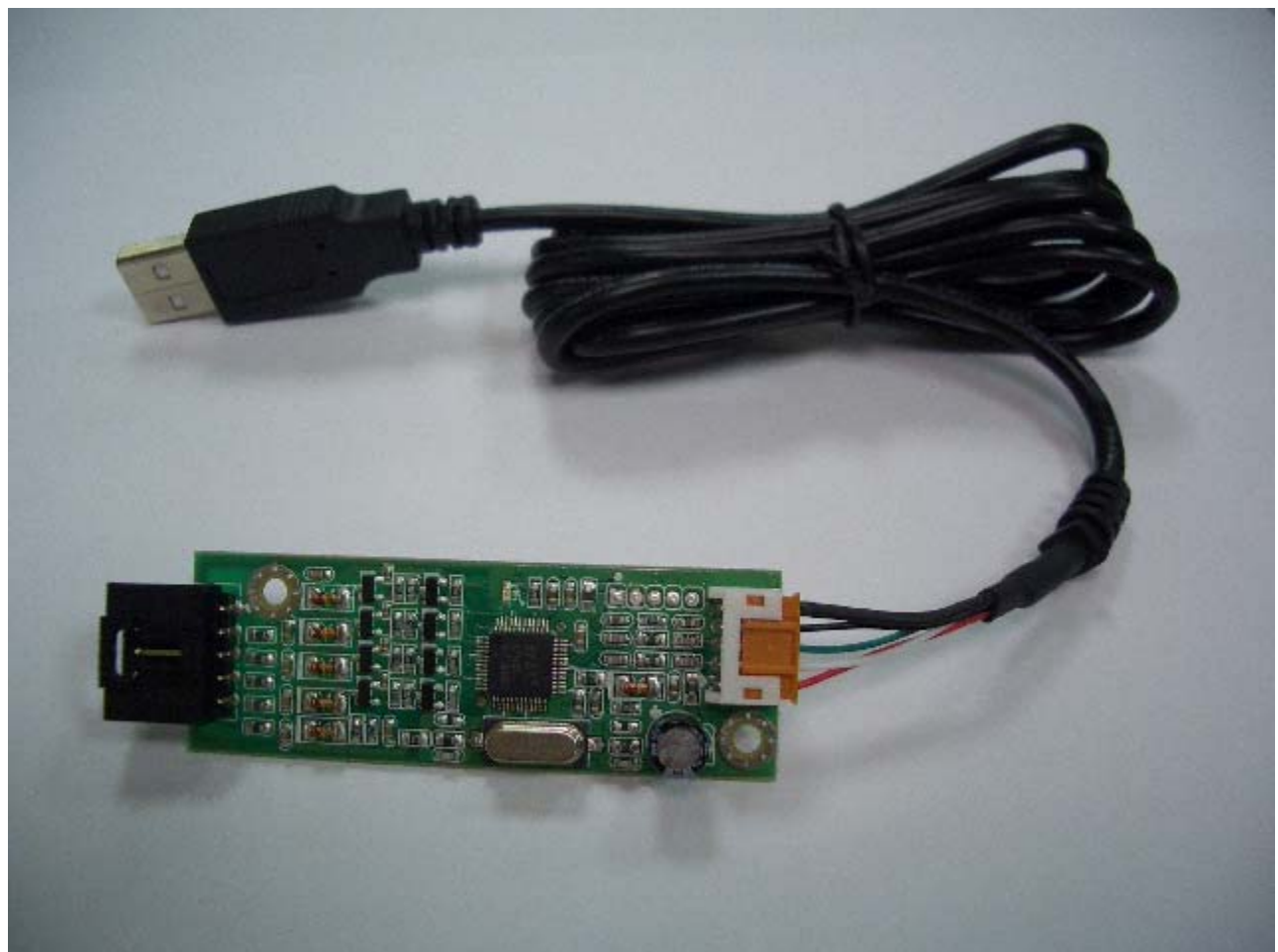
Small Board Type