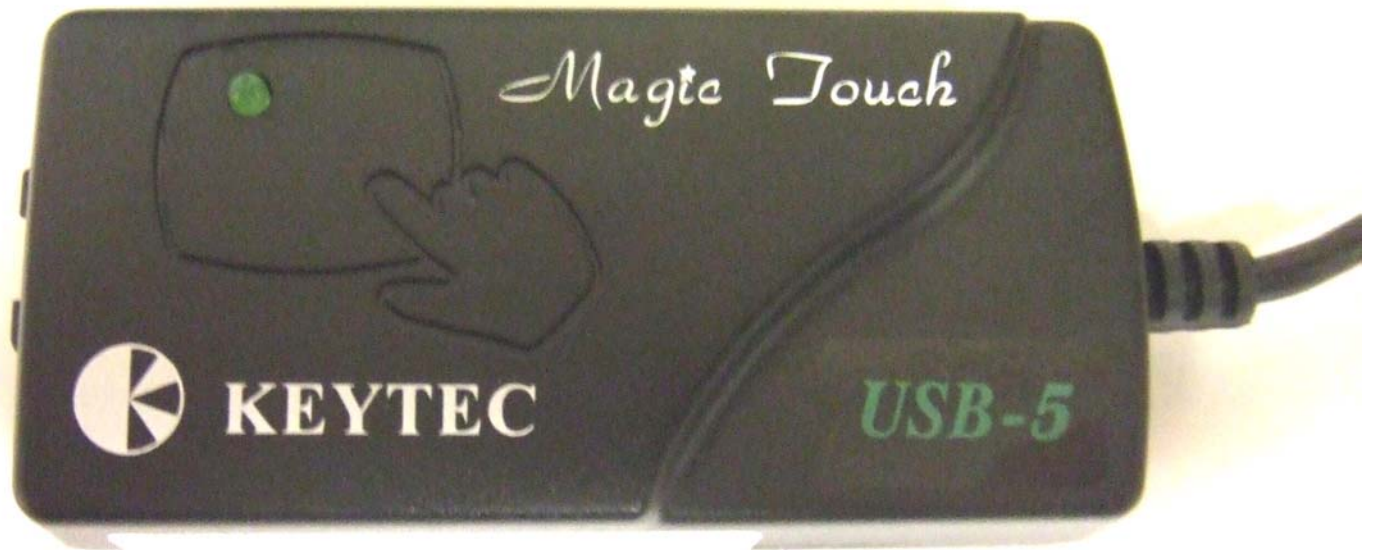
External Box Type